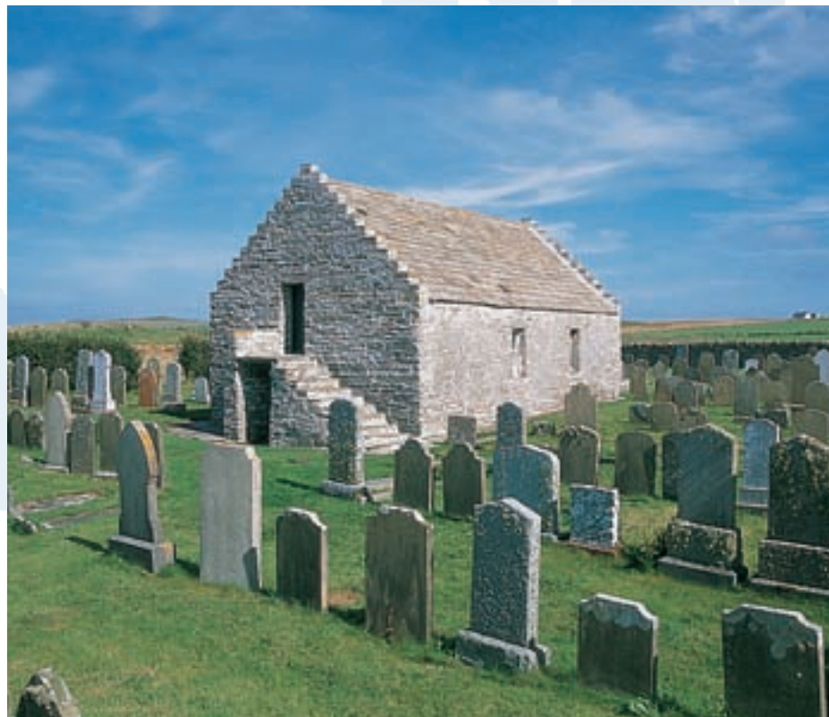
st boniface kirk - charles tait

One of the farm workers' bothies has been converted into a compact museum displaying a fascinating range of artifacts from the island's history including the parish handcuffs!