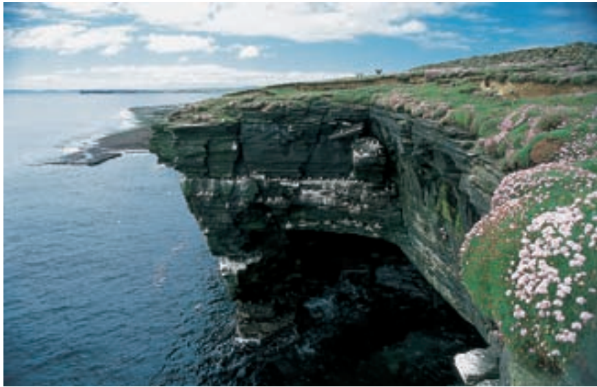
fowl craig - charles tait