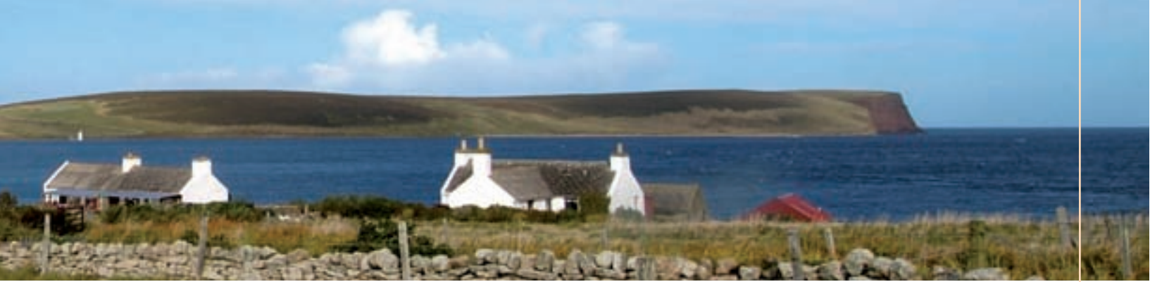
calfsound, eday- charles tait