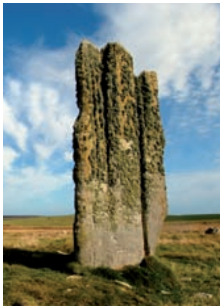
stone of setter - charles tait