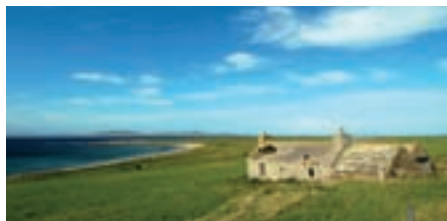
eday - charles tait